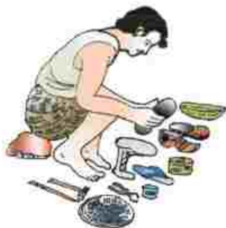
Picture 2.6 Can you remember how much did you pay when you asked him to mend your shoes or slippers?

seems forced upon them. They may therefore want other work of their choice. Poor people cannot afford to sit idle. They tend to engage in any activity irrespective of its earning potential. Their earning keeps them on a bare subsistence level.