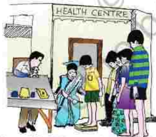
Picture 2.5 Children standing in queue for health check-up

Source: National Health Profile, 2021, 2022 Human Development Report, UNDP mohfw.gov.in (Office of Registrar General & Census Commission, India MoHA (accessed on 29.09.2021, 6.02.2024)