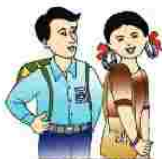
Picture 2.4 School children

national income, cultural richness and increases the efficiency of governance. There is a provision made for providing universal access, retention and quality in