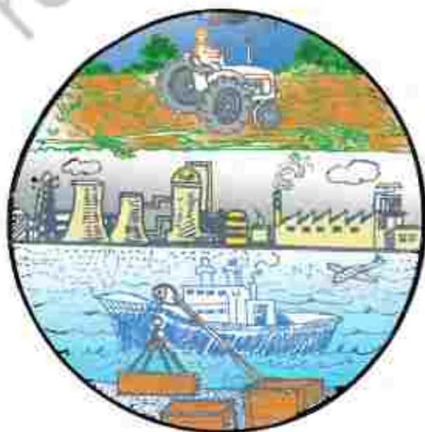
Picture 2.3 Based on the picture can you classify these activities into three sectors?

Like Vilas and Sakai, people have been engaged in various activities. We saw that Vilas sold fish and Sakai got a job in the firm. The various activities have been classified into three main sectors i.e., primary, secondary and tertiary. Primary sector includes agriculture, forestry, animal husbandry, fishing, poultry farming, mining and quarrying. Manufacturing is included in the secondary sector. Trade, transport, communication, banking, education, health, tourism, services, insurance, etc. are included in the tertiary sector. The activities in this sector result in the production of goods and services. These activities add value to the national income. These activities are called economic activities. Economic activities have two parts — market activities and non-market activities. Market activities involve remuneration to anyone who performs i.e., activity performed for pay or profit. These include production of goods or services, including government service. Non-market activities are the production for self-consumption. These can be